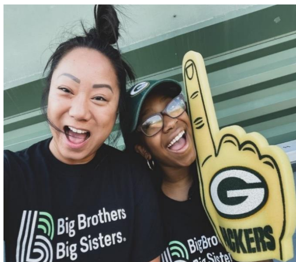
Volunteers at Big Brother Big Sisters of Racine and Kenosha Counties, Inc. enjoy their time spent mentoring youth.